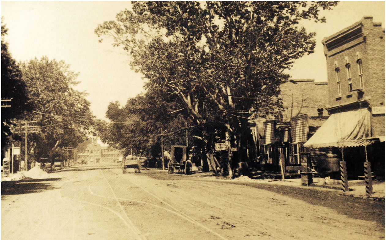
Ogden about 1870